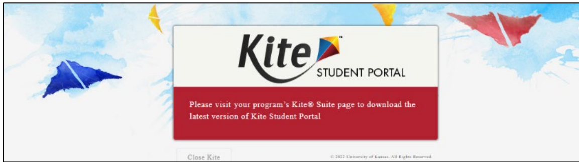
Kite Student Portal Error Message

Staff and educators have accounts in Kite Educator Portal .